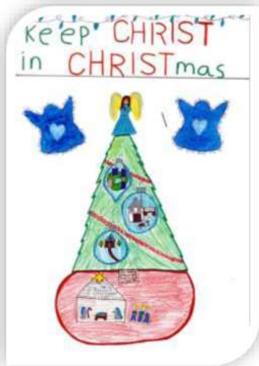
Abigail Bedore age 11-14