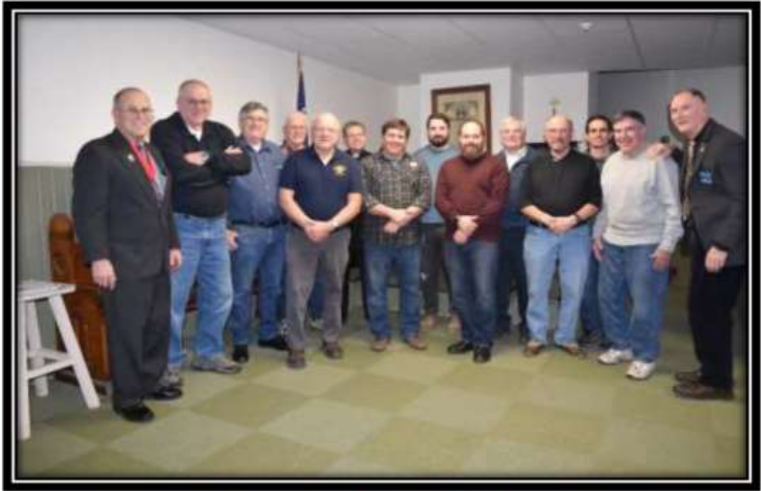
Middlebury Council 642