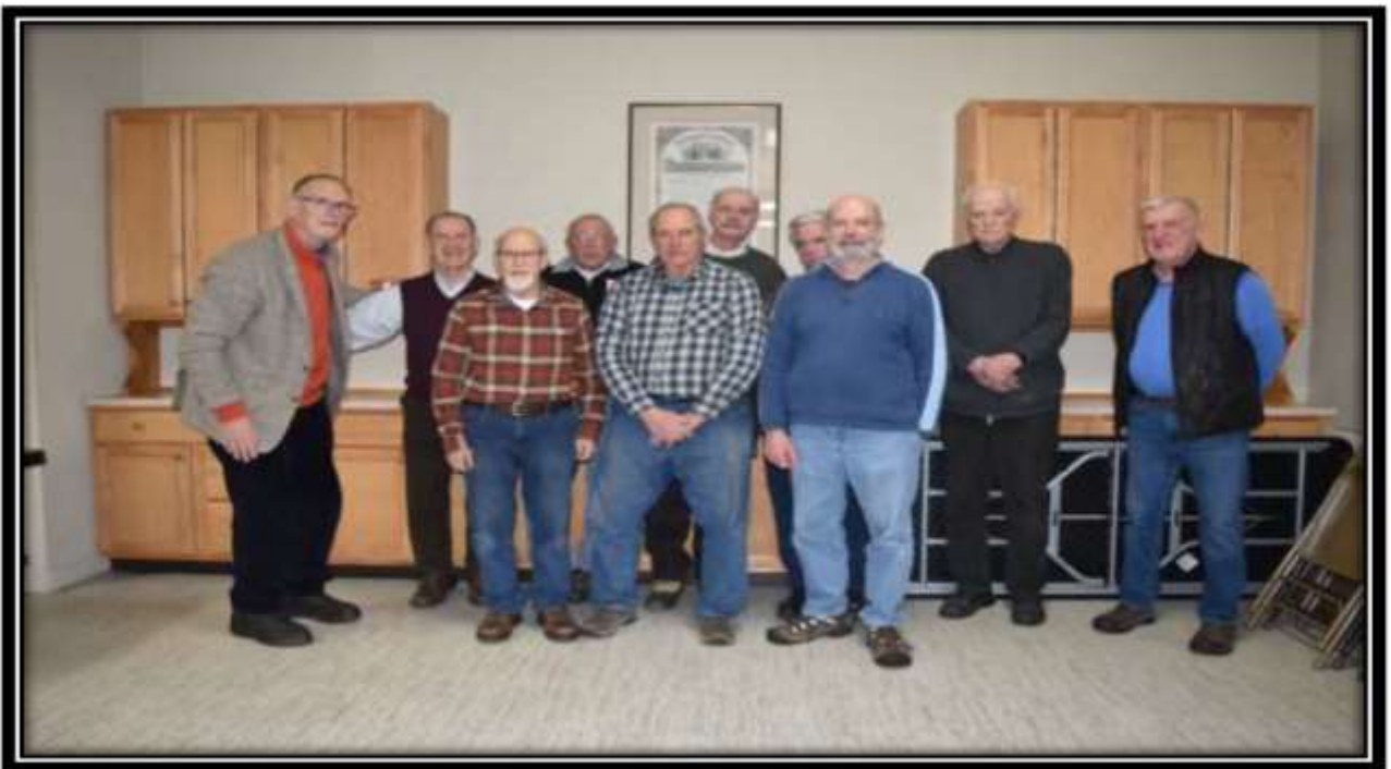
Manchester Council 6816