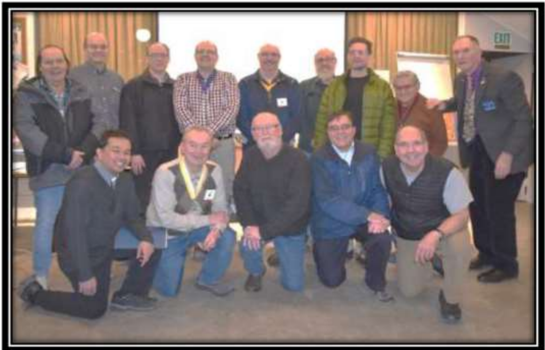
Richmond Council 4684